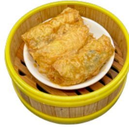
鮑汁鮮竹卷 Bean Curd Rolls $7.25 (3 Pcs)