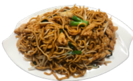
炒麵 (菜, 雞, 牛, 豬, 或叉燒) Chow Mein (Vegetable, Chicken, Beef, Pork, or BBQ Pork) $18.95