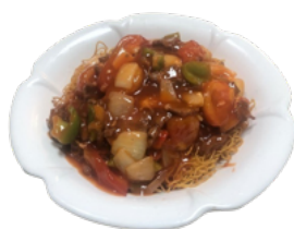
番茄牛煎麵 Tomato and Beef Fried Noodles $22.95