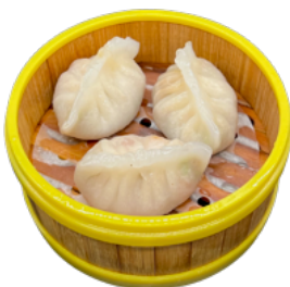
潮州蒸粉粿 Chao-Zhou Style Dumplings (Contains Peanuts) $6.99 (3 Pcs)