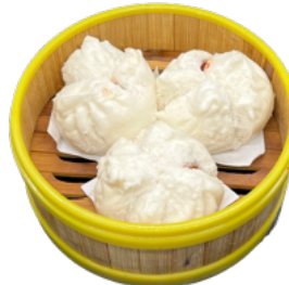
蠔皇叉燒包 Steamed BBQ Pork Buns $6.75 (3 Pcs)