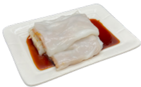
牛肉腸粉 Beef Rice Noodle Rolls (Served Until 3 PM) $7.99