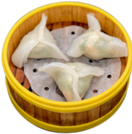
晶瑩菲菜餃 Steamed Shrimp and Chives Dumplings $7.99 (3 Pcs)