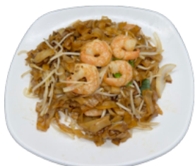
虾仁河粉 Shrimp Chow Fun $21.95