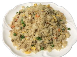
雜錦炒飯 House Deluxe Fried Rice $20.95