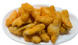
金沙南瓜 Fried Kabocha Squash with Salted Egg Yolk $11.95