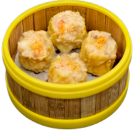
香菇燒賣皇或黑松露燒賣皇 Jumbo Siu Mai or Truffle Siu Mai $7.99 or $11.99 (4 Pcs)