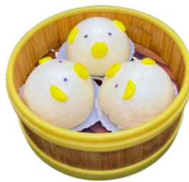
奶黃豬仔包 Piggy Egg Custard Buns $8.50 (3 Pcs)