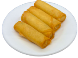
齋春卷 Vegetarian Egg Rolls $5.50 (4 Pcs)