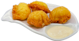
酥炸明蝦角 Deep Fried Shrimp Dumplings $8.99 (4 Pcs)