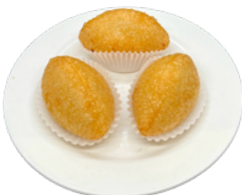
家鄉鹹水角 Fried Glutinous "Football" Dumplings $6.75 (3 Pcs)