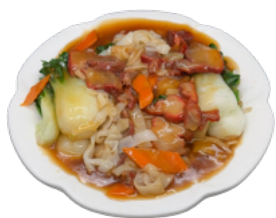
濕炒河粉 (菜, 雞, 牛, 猪, 或叉燒) Gravy Chow Fun (Vegetable, Chicken, Beef, Pork, or BBQ Pork) $20.95