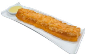
蝦多士 Shrimp Toast $12.99