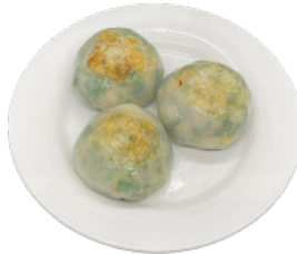
香煎菲菜棵 Pan Fried Shrimp and Chives Dumplings $7.99 (3 Pcs)