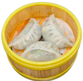
豆苗雜菌素餃 Pea Shoot Mushroom Dumplings $7.75 (3 Pcs)