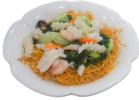
港式海鮮煎麵 Hong Kong Style Seafood Fried Noodles $23.95