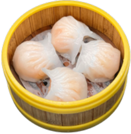
美味蝦餃皇 Jumbo Shrimp Har Gaw $7.99 (4 Pcs)