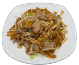
乾炒河粉 (菜, 雞, 牛, 猪, 或叉燒) Stir Fried Chow Fun (Vegetable, Chicken, Beef, Pork, or BBQ Pork) $19.95