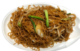
豉油皇炒麵 (點心) Supreme Soy Sauce Chow Mein (Dim Sum Size) $11.75