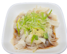
白灼牛百葉 Poached Beef Tripe $13.75