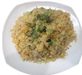
鹹魚雞粒炒飯 Salted Fish and Chicken Fried Rice $21.95