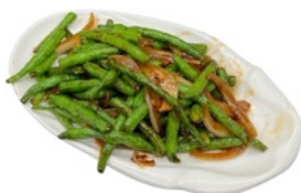
乾扁四季豆 (點心) Sautéed String Beans (Dim Sum Size) $11.75