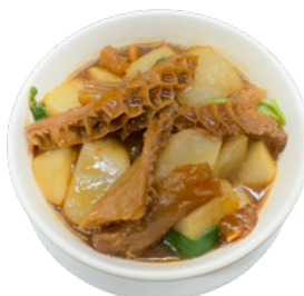
蘿蔔炆牛雜 Bovine Offal with Daikon $14.95