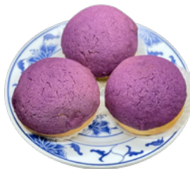
焗紫薯包 Baked Ube Buns $7.75