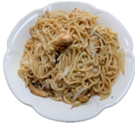
大蒜麵 Garlic Noodles $17.95