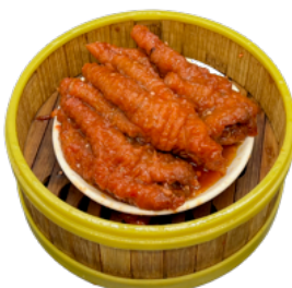
豉汁蒸鳳爪 Chicken Feet in Black Bean Sauce $6.99