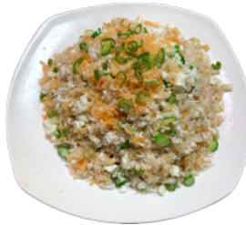
瑤柱蛋白炒飯 Dried Scallop Egg White Fried Rice $21.95