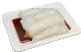
齋腸粉 Plain Rice Noodle Rolls (Served Until 3 PM) $6.75