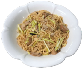
蟹肉菲王伊麵 Crab Meat E-Fu Noodles $26.25