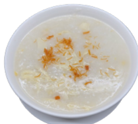
瑤柱腐竹白果粥 Dried Scallop, Ginkgo, and Yuba Congee $14.50