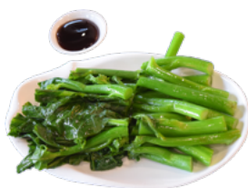
蠔油芥蘭 (點心) Chinese Broccoli with Oyster Sauce (Dim Sum Size) $11.95