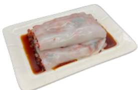
叉燒腸粉 BBQ Pork Rice Noodle Rolls (Served Until 3 PM) $7.99