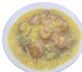
滑蛋虾仁河粉 Shrimp Chow Fun with Egg Gravy $22.95