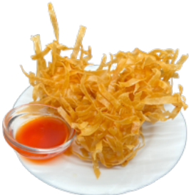
百花炸蝦丸 Crispy Shrimp Meatballs $8.99 (3 Pcs)