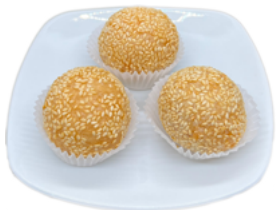
芝麻煎堆球 Fried Sesame Balls $6.75