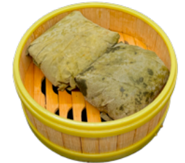
珍珠糯米雞 Sticky Rice Lotus Leaf Wraps $7.75 (2 Pcs)