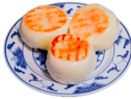
特色生煎包 Pan Fried Pork Buns $6.99 (3 Pcs)