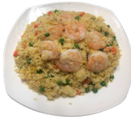
蝦仁炒飯 Shrimp Fried Rice $19.95