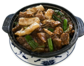
牛腩腸粉煲 Clay Pot Beef Stew Rice Noodle Rolls $16.99