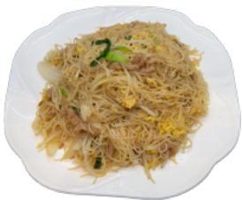
炒米粉 (雞或豬) Vermicelli Noodles (Chicken or Pork) $19.95