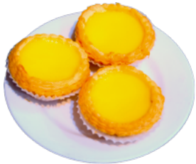
酥皮蛋撻 Baked Egg Tarts (Served Until 3 PM) $6.75