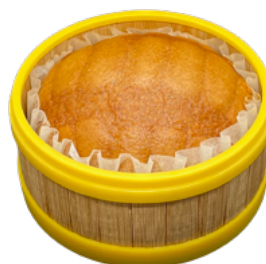
古法馬拉糕 Steamed Sponge Cake $6.75