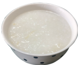
明火白粥 Plain Congee $5.99