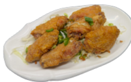
椒鹽雞翼 Salt and Pepper Chicken Wings $15.50