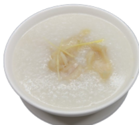
生滾魚片粥 Fish Fillet Congee $13.99