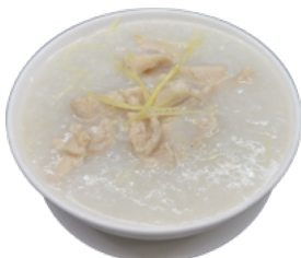
生滾滑雞粥 Chicken Congee $12.99