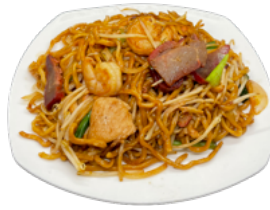
雜錦炒麵 House Deluxe Chow Mein $21.95