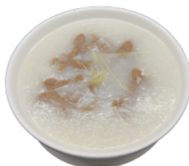
生滾牛肉粥 Beef Congee $12.99