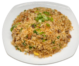
炒飯 (菜, 雞, 牛, 豬, 或叉燒) Fried Rice (Vegetable, Chicken, Beef, Pork, or BBQ Pork) $18.95