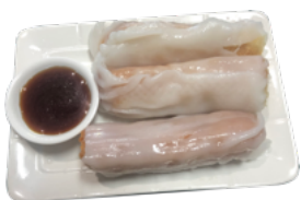
炸兩 Chinese Donut Rice Noodle Rolls (Served Until 3 PM) $7.99