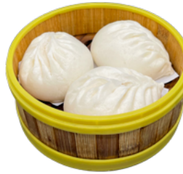
美味雞包 Steamed Chicken Buns $6.75 (3 Pcs)