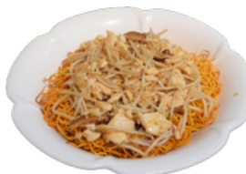
港式煎麵 (菜, 雞, 牛, 猪, 或叉 燒) Hong Kong Style Fried Noodles (Vegetable, Chicken, Beef, Pork, or BBQ Pork) $19.95