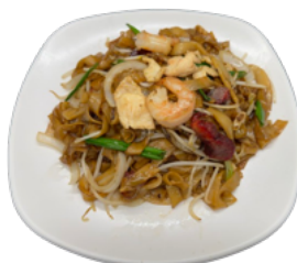
雜錦炒粉 House Deluxe Chow Fun $22.95