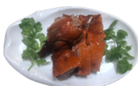
美味燒鴨 (點心) Roast Duck (Dim Sum Size, Quarter Duck) $13.75