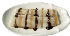
混醬腸粉 Mixed Sauce Rice Noodle Rolls (Served Until 3 PM) $6.99