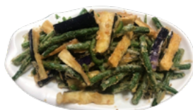
椒鹽豆角茄子 Salt and Pepper String Beans and Eggplants $11.75