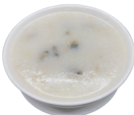
皮蛋瘦肉粥 Pork and Preserved Egg Congee $12.99