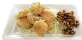
合桃明蝦 (點心) Honey Glazed Walnut Shrimp (Dim Sum Size) $15.75