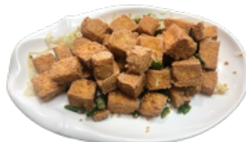
椒鹽豆腐 Salt and Pepper Crispy Tofu $11.95