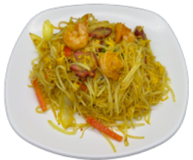
星州炒米粉 Singapore Style Curry Vermicelli Noodles $20.95