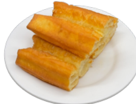
黃金油條 Deep Fried Chinese Donuts $5.50