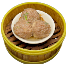
山竹牛肉球 Supreme Beef Meatballs $6.99 (3 Pcs)