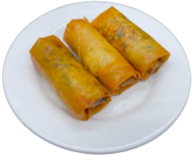
鮮蝦炸春卷 Crispy Shrimp Egg Rolls $8.99 (3 Pcs)