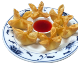
炸蟹角 Crab Rangoon Puffs $7.99 (6 Pcs)