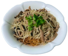
芽菜肉絲煎面 Shredded Pork Bean Sprouts Fried Noodles $20.95