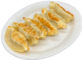
香煎鍋貼 Pot Stickers $8.99 (6 Pcs)