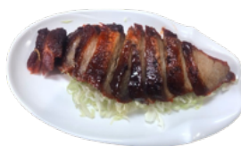
美味叉燒 BBQ Pork Slices $13.50