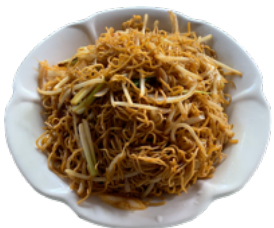
豉油皇炒麵 (主菜) Supreme Soy Sauce Chow Mein (Entrée Size) $17.95