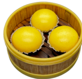
甘筍流沙包 Steamed Custard Lava Buns $7.99 (3 Pcs)