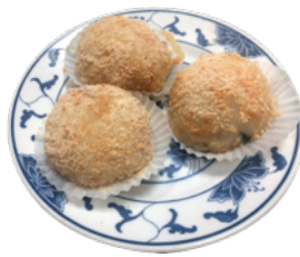
播沙湯圓 Chinese Sesame Soft Balls $7.75