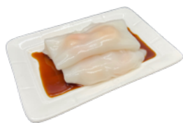
鮮蝦腸粉 Shrimp Rice Noodle Rolls (Served Until 3 PM) $8.99