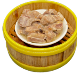
豉汁蒸排骨 Spare Ribs in Black Bean Sauce $6.99