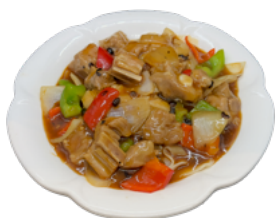
豉椒排骨河粉 Spare Ribs Chow Fun in Black Bean Sauce $21.95