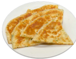
香煎蔥油餅 Flaky Scallion Pancakes $5.99 (3 Pcs)