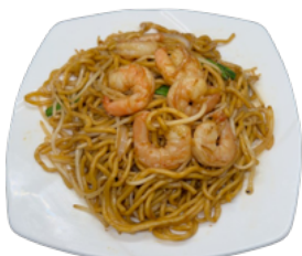
蝦仁炒麵 Shrimp Chow Mein $19.95