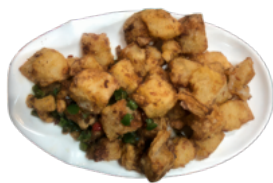
XO 醬炒蘿蔔糕 XO Sauce Pan Fried Daikon Cakes $11.75