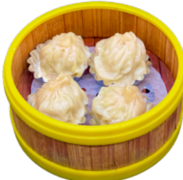
上海小籠包 Shanghai Pork Soup Dumplings $7.75 (4 Pcs)