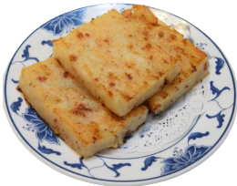
香煎蘿蔔糕 Pan Fried Daikon Cakes $6.75 (3 Pcs)