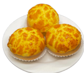
菠蘿奶黃包 Crispy Custard Buns $7.75 (3 Pcs)