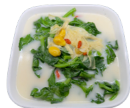
銀杏枝竹浸 (菠菜或 豆苗) Ginkgo, Yuba, and (Spinach or Pea Shoots) in Broth $13.50 or $15.50