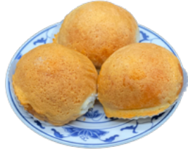
焗叉燒包 Baked BBQ Pork Buns (Served Until 3 PM) $6.75 (3 Pcs)