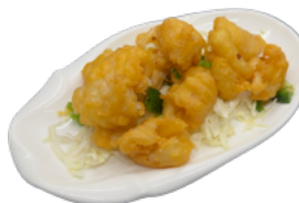
椒鹽魷魚 Salt and Pepper Calamari $13.75