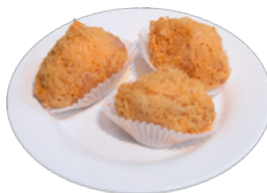
蜂巢芋角 Fried Taro Pork Dumplings (Served Until 3 PM) $6.95