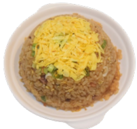
生炒糯米飯 Stir Fried sticky Rice $11.75