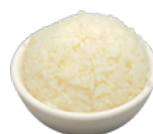
絲苗白飯(碗) Jasmine Rice (Per Bowl) $2.25